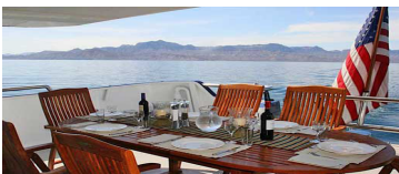
Aft Deck Master Suite

Learn more: Take a tour of the Northern Song - www.YachtAlaska.com