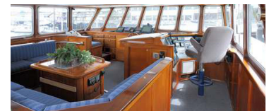
Pilot House Dining